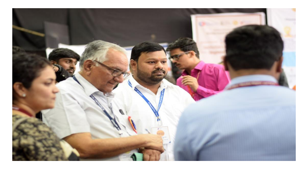
Fig 3: Judges evaluating IIC posters during IIC regional meet 2023

IIC institutions presented a IIC poster in the form of a foldable or rollup standee (standard dimensions of 3 feet in width and 6 feet in height) during the IIC regional meet. Institutions got exposure to present IIC initiatives and achievements related to Innovation, Entrepreneurship, Startup, IP etc. Total 36 institutions participated in IIC poster. Best three posters awarded during valedictory program.