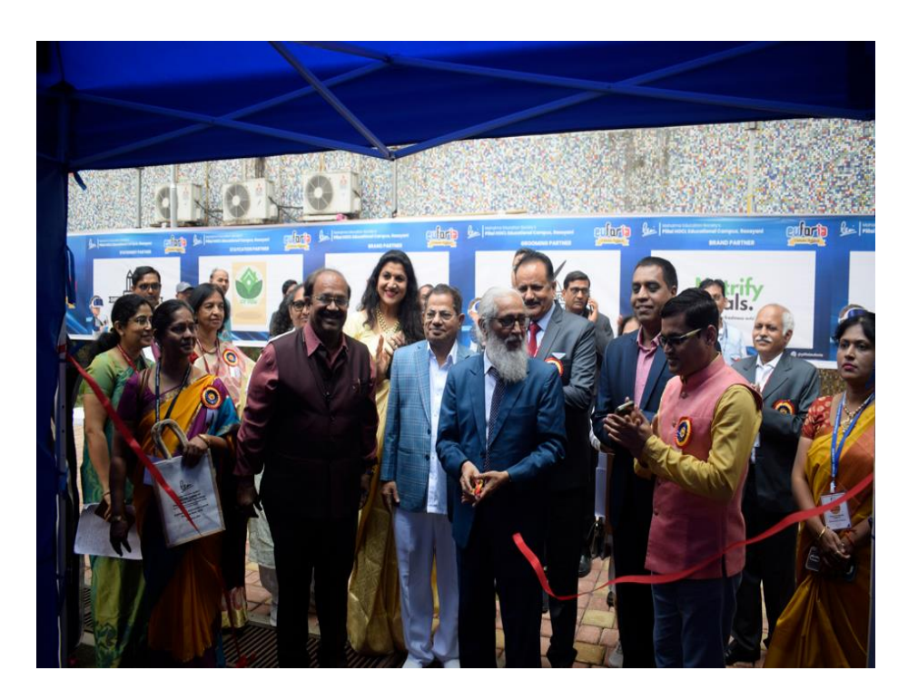
Fig1: Inaugural of IIC regional Meet Open House Events