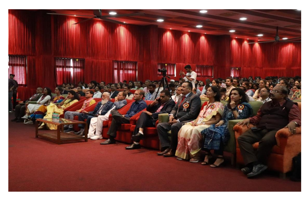
Fig 2 d): Inaugural of IIC regional Meet 2023