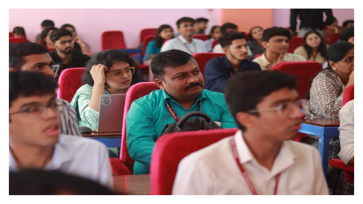
Fig 8: Mentoring cum Pitching Session