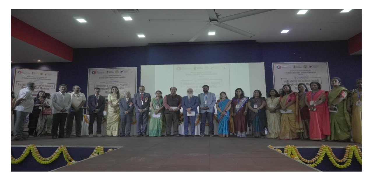
Fig 9: Organizing committee members from Host institute PHCET, Rasayani