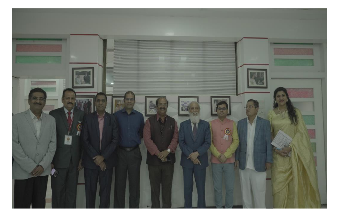
Fig 2 c): Dignitaries present for the Inaugural of IIC regional Meet 2023