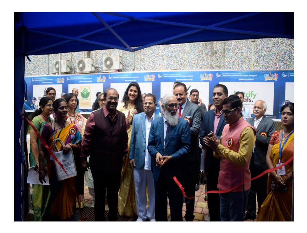
Fig1: Inaugural of IIC regional Meet Open House Events