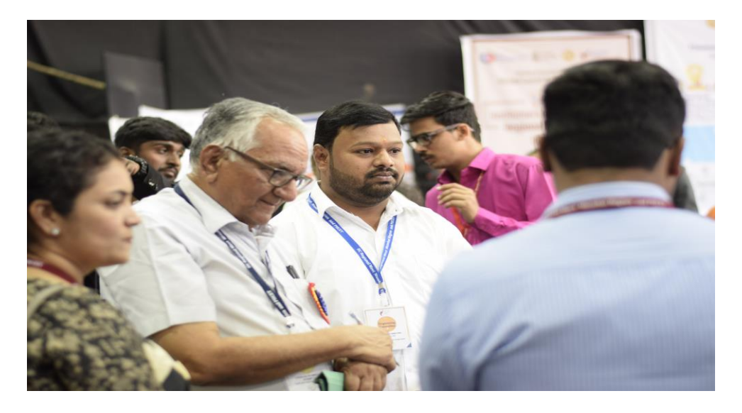
Fig 3: Judges evaluating IIC posters during IIC regional meet 2023

IIC institutions presented a IIC poster in the form of a foldable or rollup standee (standard dimensions of 3 feet in width and 6 feet in height) during the IIC regional meet. Institutions got exposure to present IIC initiatives and achievements related to Innovation, Entrepreneurship, Startup, IP etc. Total 36 institutions participated in IIC poster. Best three posters awarded during valedictory program.