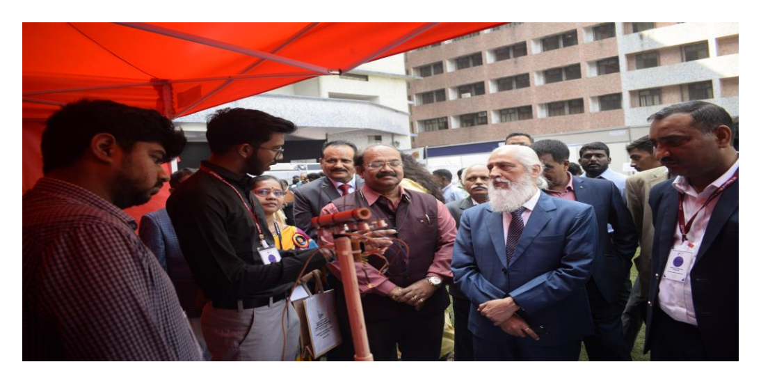
Fig 7: Yukti Participant demonstrating Project to Chief Guest and Guest of Honors

4. Yukti Innovation Design Challenge: Faculty and student innovators got an opportunity to exhibit their innovations and receive one-to-one mentoring from the panel of experts during IIC regional meet. Based on their performance in these rounds, the best innovations and start-ups will be shortlisted for the final round of the YUKTI Innovation Challenge for a national-level start-ups boot camp.