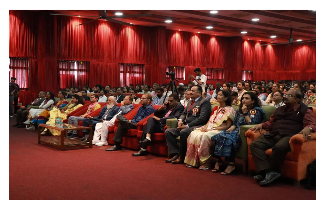
Fig 2 d): Inaugural of IIC regional Meet 2023