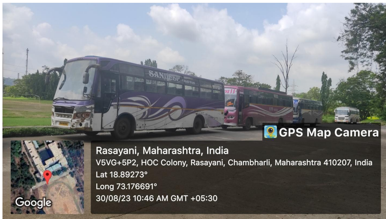
Figure: College Bus