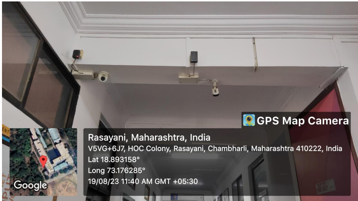
Figure 1: CCTV for surveillance

PHCET has a first aid room with resting facility and doctor on call. In case of any major case that cannot be handled in-house, the patient is immediately taken to a hospital close by. PHCET considers providing best possible medical help under the prevailing conditions is its bounden duty with no questions asked.