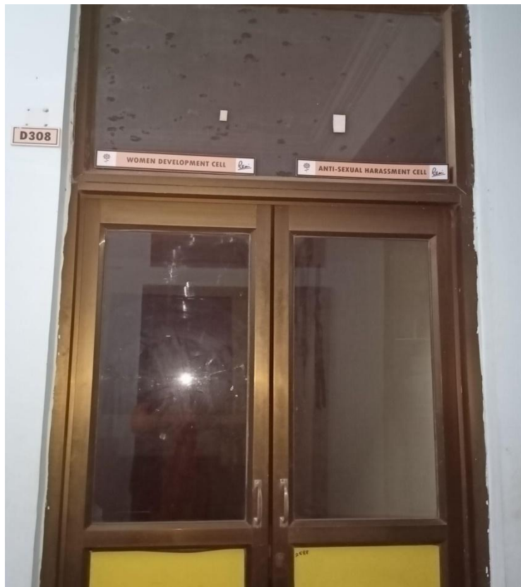
Figure 3.b: Women Development Cell and Anti Sexual Harassment Cell