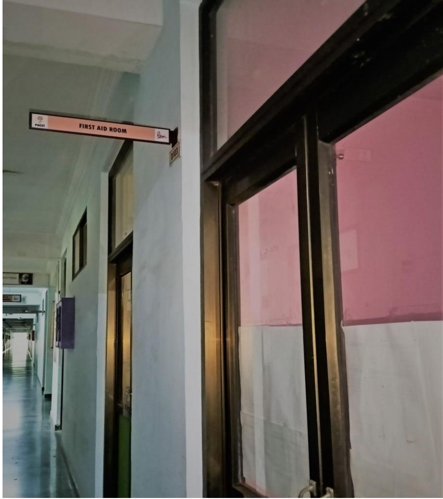
Figure 2.b : First Aid Room