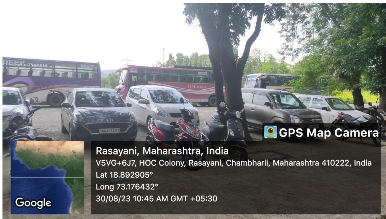
Figure: College Bus

PHCET provides transport on a subsidized rate for students and free for the faculty and staff and provides considerable security with respect to travel related accidents and other difficulties that people encounter on a daily basis. The bus Arrives and departs at fixed timings to ensure faculty and students are never late.