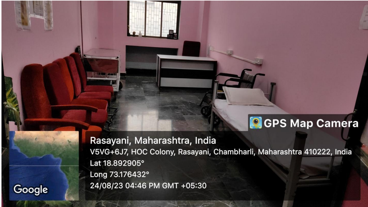
Figure 2.a: First Aid Room