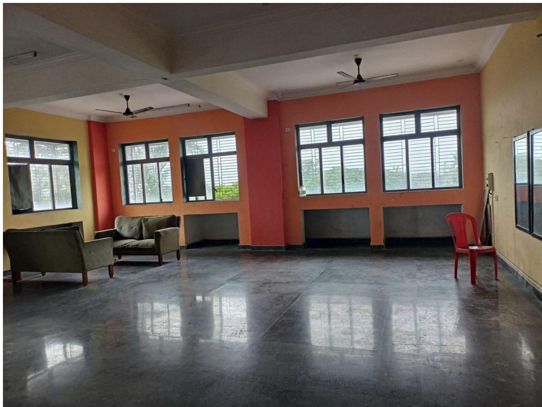
Figure: Girls Common Room

PHCET has provided an adequate number of wash rooms for girls on every floor and a common room with facilities for resting. If any student, faculty or staff is unwell they can use the facility of the common room to take rest during college hours. People who are differently-abled and those who suffer from temporary setbacks due to accidents, etc. are given the support needed. PHCET provides special needs for students who are unwell and injured. Friendliness and compassion are part of the ethos of PHCET.