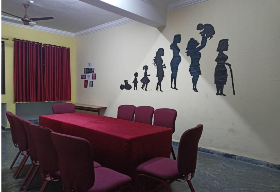
Figure 3.a: Women Development Cell and Anti Sexual Harassment Cell