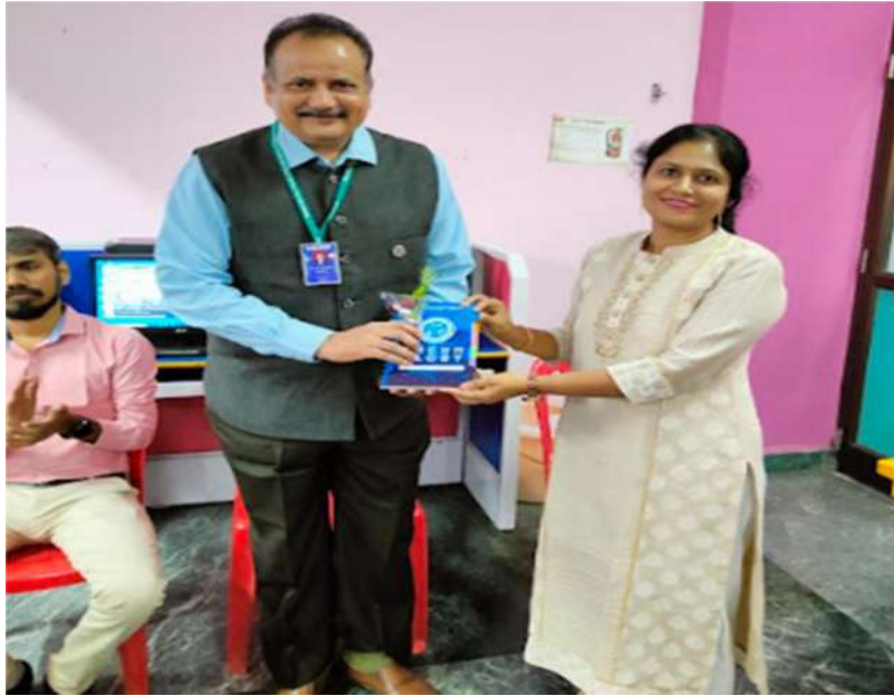
Hands on workshop on Django