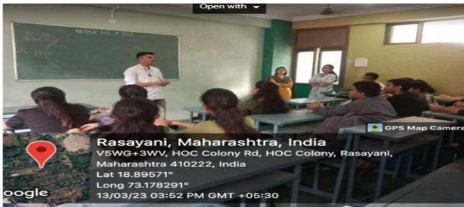
Seminar on Performance management