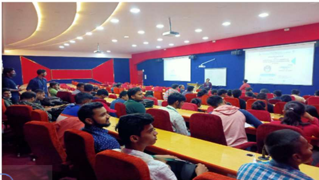
Webinar "Data Annotation"