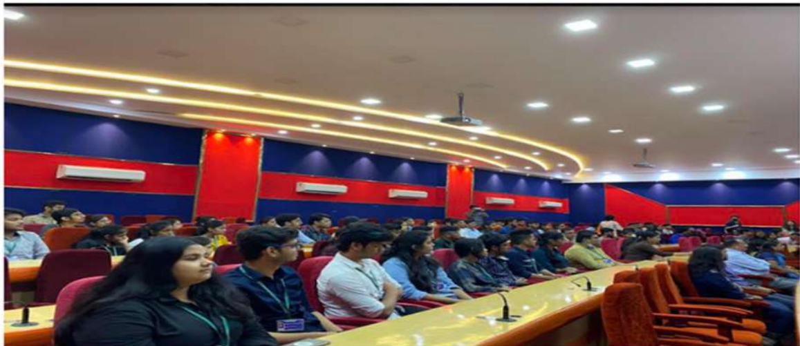
Expert lecture on “Recent trends of technology in Industry”