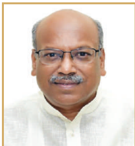
Sanjay Shamrao Dhotre Minister of State for Human Resource Development

India aspires to become a 5 trillion dollar economy in a near future. To reach this mark, it needs to evolve system and mechanisms to convert the present demographic dividend into high quality technical human resource, capable of doing cutting edge research and innovation, and deep-tech entrepreneurship. At this juncture, the MHRD's Innovation Cell and AICTE have brought out the 'National Innovation and Startup Policy 2019' for students and faculty.